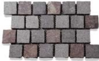
FXG107A Split Perpendicular