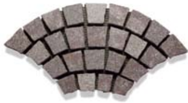
FX1151A Flamed Mixed Color Fan